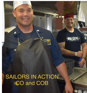
SAILORS IN ACTION CO and COB