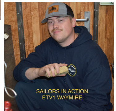
SAILORS IN ACTION ETV1 WAYMIRE

A link to a video of LTJG Bush's rescue: